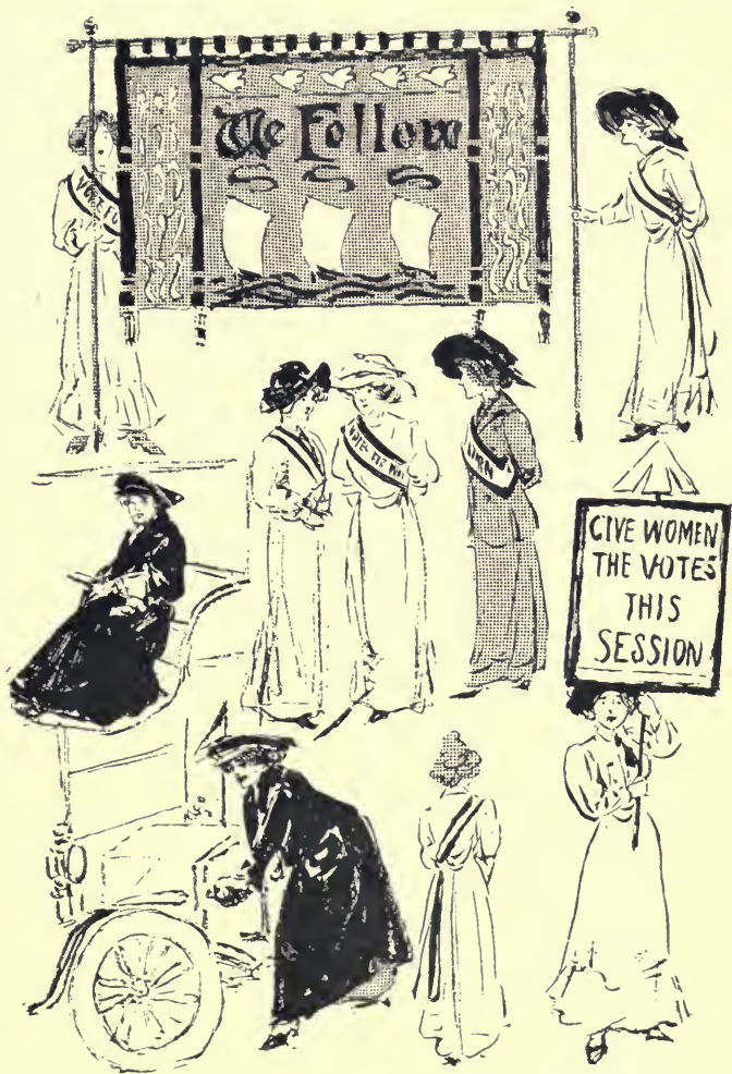
Votes for women